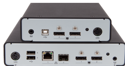
ADDERLink INFINITY 2102 TX & RX - Rear